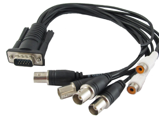
DB15 AV cable with 4 video inputs and 2 audio inputs